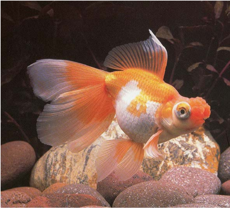
Telescope-eyed fish with pom-poms, from Goldfish in Hong Kong

The first picture shown is a fairly conventional telescope-eyed fish with Pom-Poms added. The fish appears fairly conventional, but the addition of the pom-poms makes it look slightly different