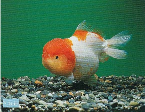
Lionhead with dorsal fin, from Goldfish in Hong Kong