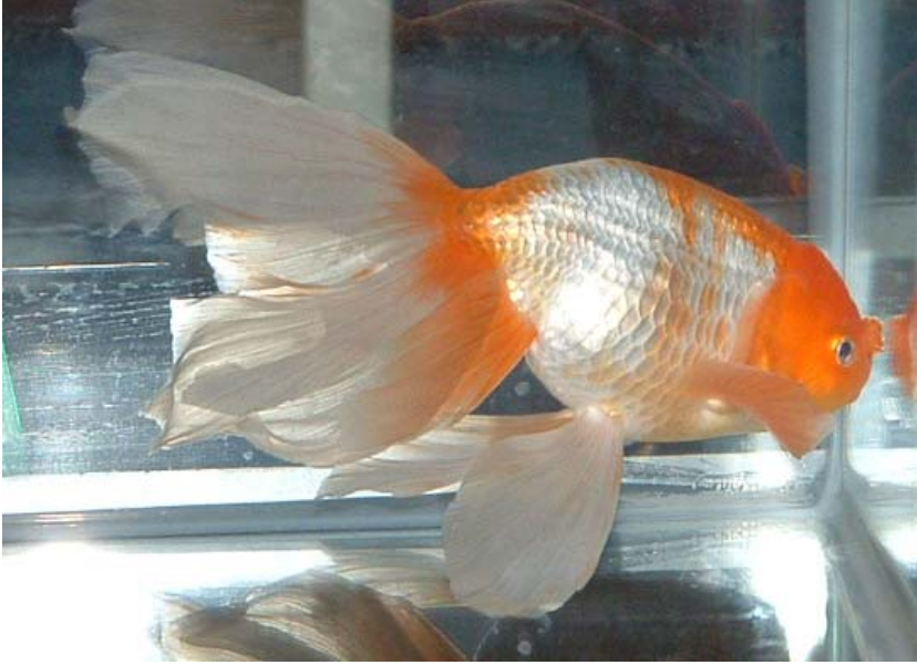
Orange Phoenix with narial bouquet

goldfish shows throughout the country. Today, they are rarely seen, and as mentioned earlier are viewed as culls of the more desirable double-tail fish. The original Philadelphia standards listed the Nymph as a separate variety of goldfish, and had point standards for this fish. Today, these fish are rarely seen, and a good specimen would probably do well in competition.