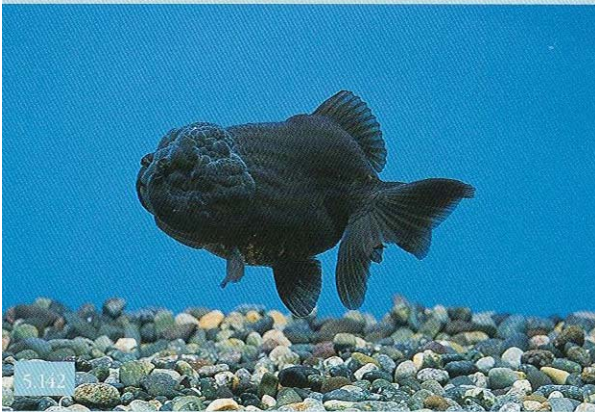
Lionhead with a dorsal, from Goldfish in Hong Kong

The next grouping of pictures shows eye-fish that are normally dorsal-less, i.e. the Bubble-eye and Celestial, with a dorsal fin. Once again, these fish look slightly odd since we are used to seeing them without a dorsal. As in the Lionhead with a dorsal, the placement of the dorsal fin on these fish seems to start farther back than we would expect.